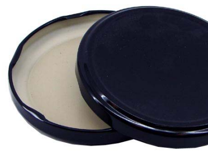
Lid seals are usually white or cream.