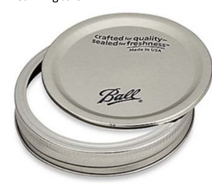
The classic 'Ball' two-part lid